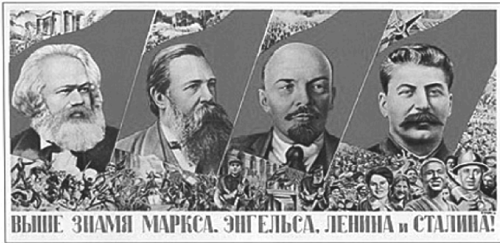
The annual May Day celebration in Red Square was a Litvyak Family Tradition.

THE FIRST OF MAY WAS considered one of the greatest working-class holidays of the year for millions of Muscovites.